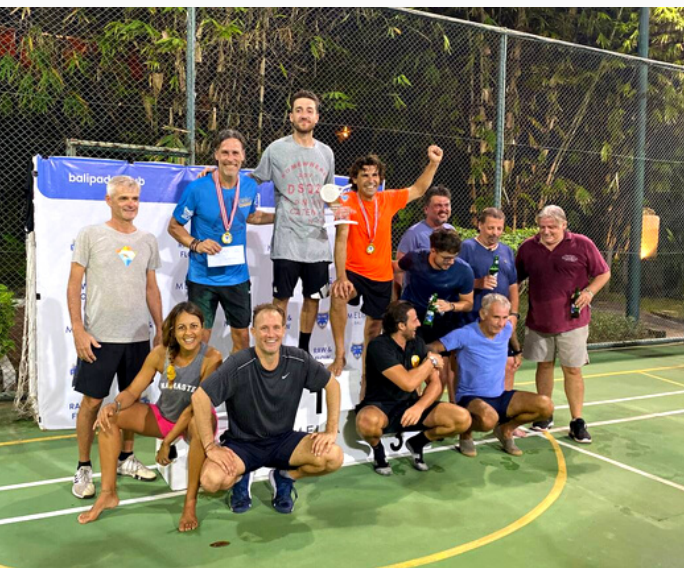
Competitors from the 2nd Indonesia International Padel tournament

We don't know if the more than 1000 temples this beautiful island has have contributed to the success this sport entrepreneur has had so far, but in the next few months he will open 3 padel courts in a sports centre in Jakarta collaborating with the Spanish Embassy and his Indonesian business partner.