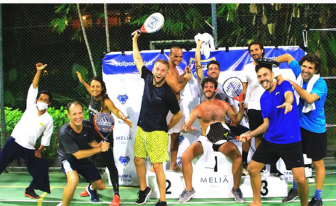
Competitors from the 3rd Indonesia International Padel tournament